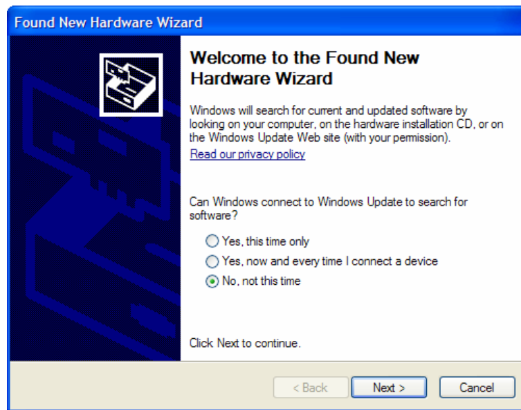
Figure 2: Found New Hardware Wizard

Depending on the operating system version, when you plug the adapter in for the first time, Windows may show the "Found New Hardware Wizard" (Figure 2).